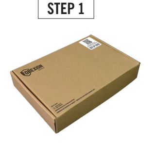
Inspect your package for defects.