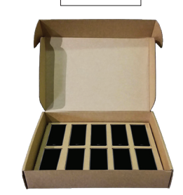
Place mobile phones face down in the holding tray.